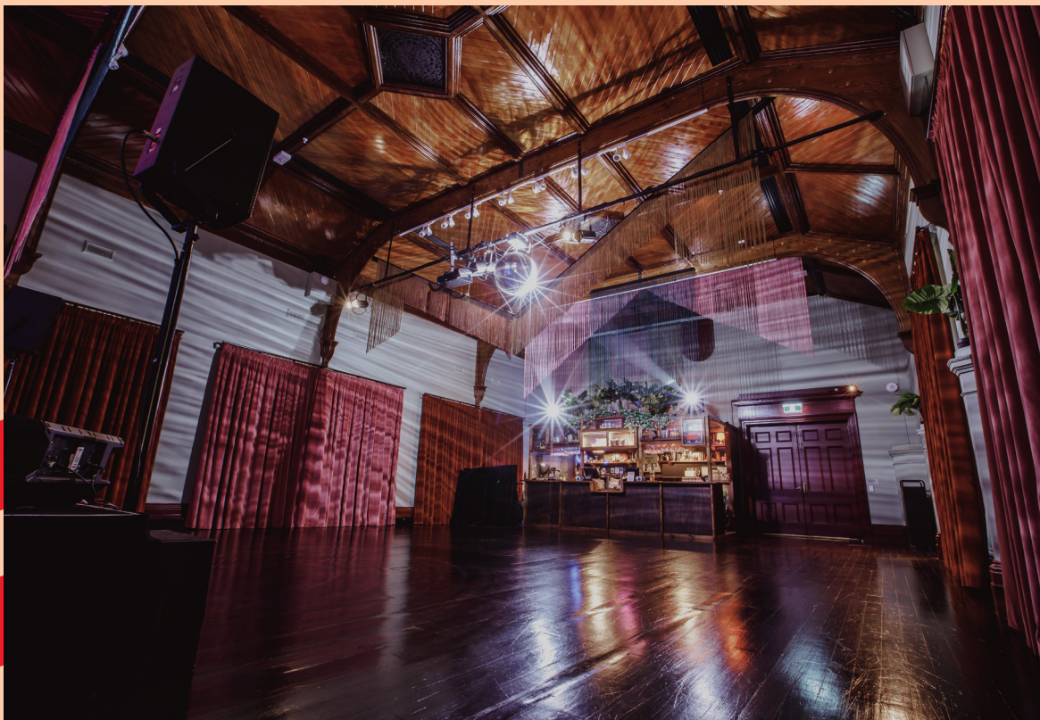
The Ballroom bar area and dance floor