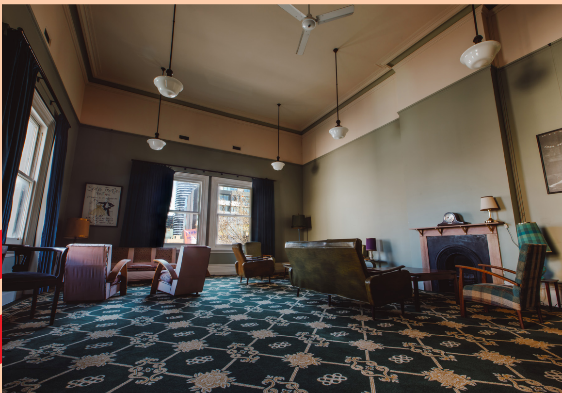
The Lounge ready for rehearsals or meetings