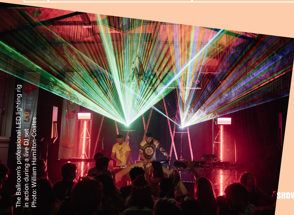
The Ballroom's professional LED lighting rig in action during a live DJ set