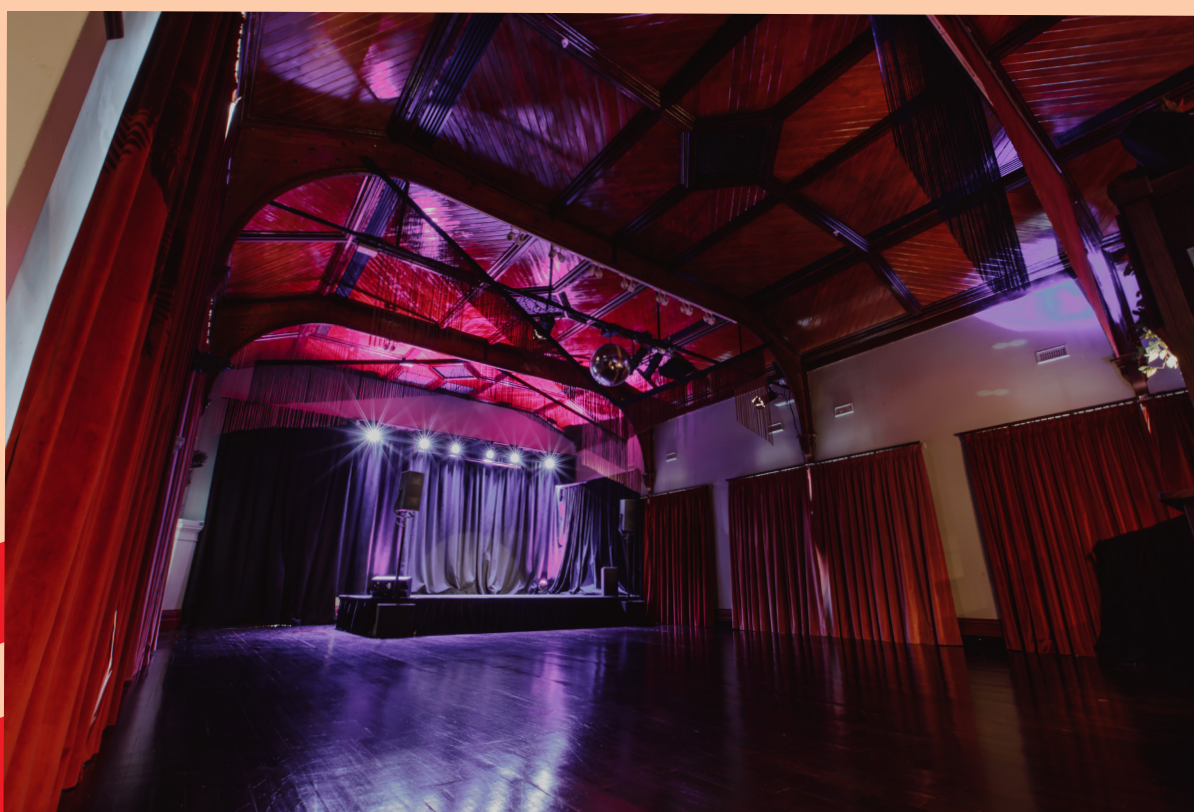
The Ballroom showing heritage features and professional stage