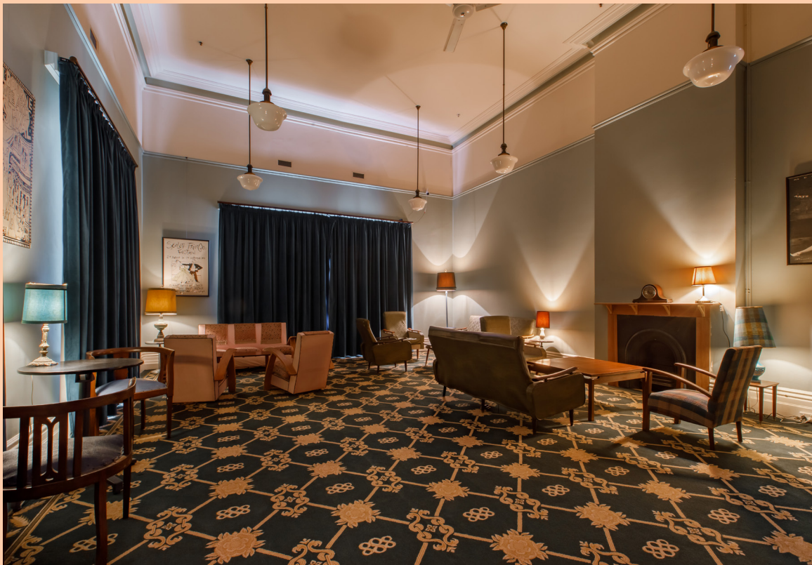
The Lounge with flexible seating options and intimate atmosphere