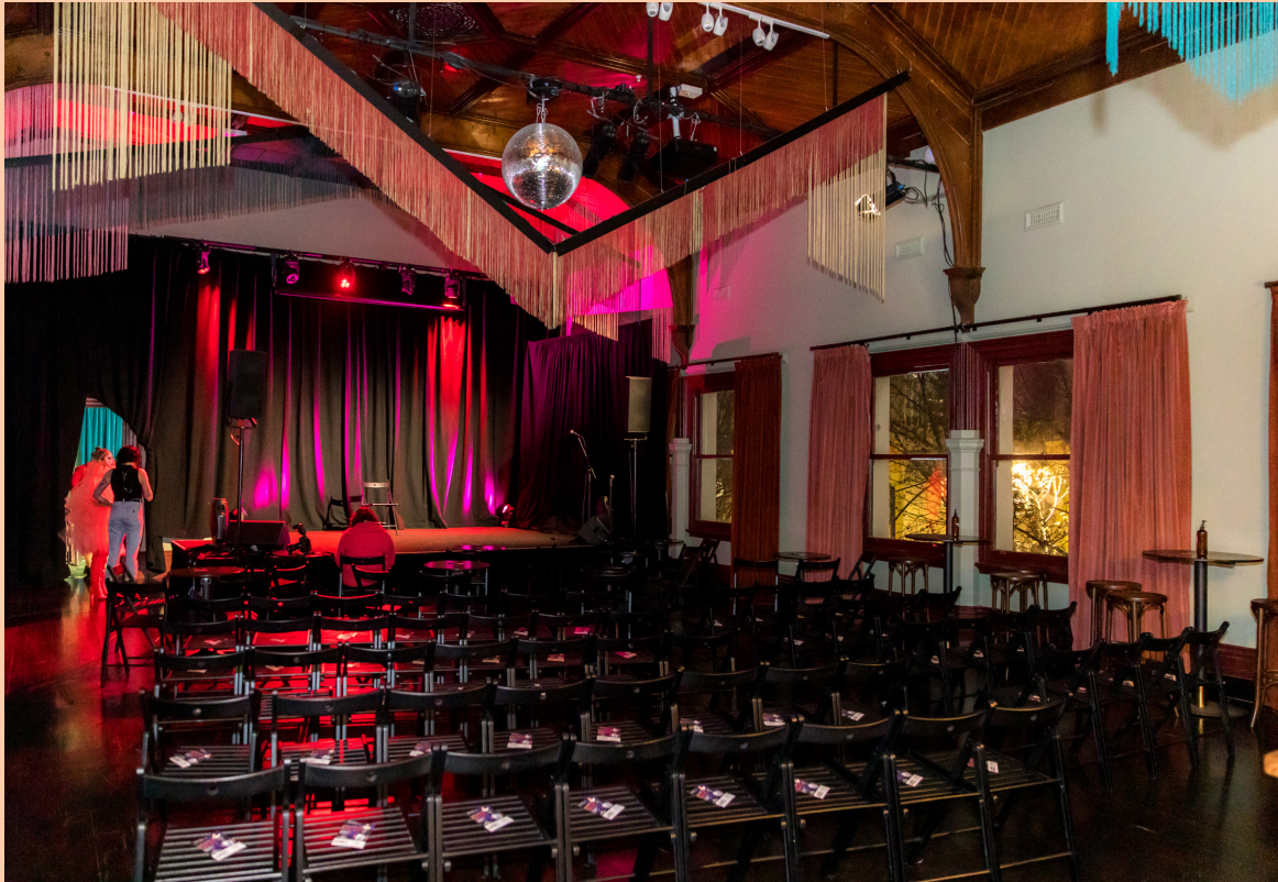
The Ballroom set for a 114-seat theatre show